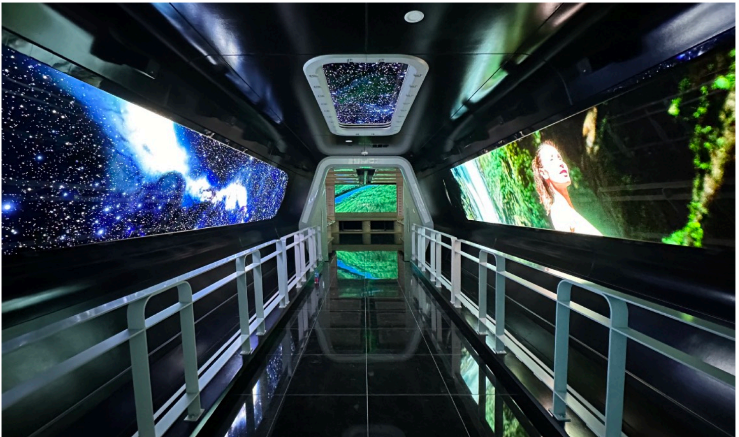
Tunnel Interior LifeWave