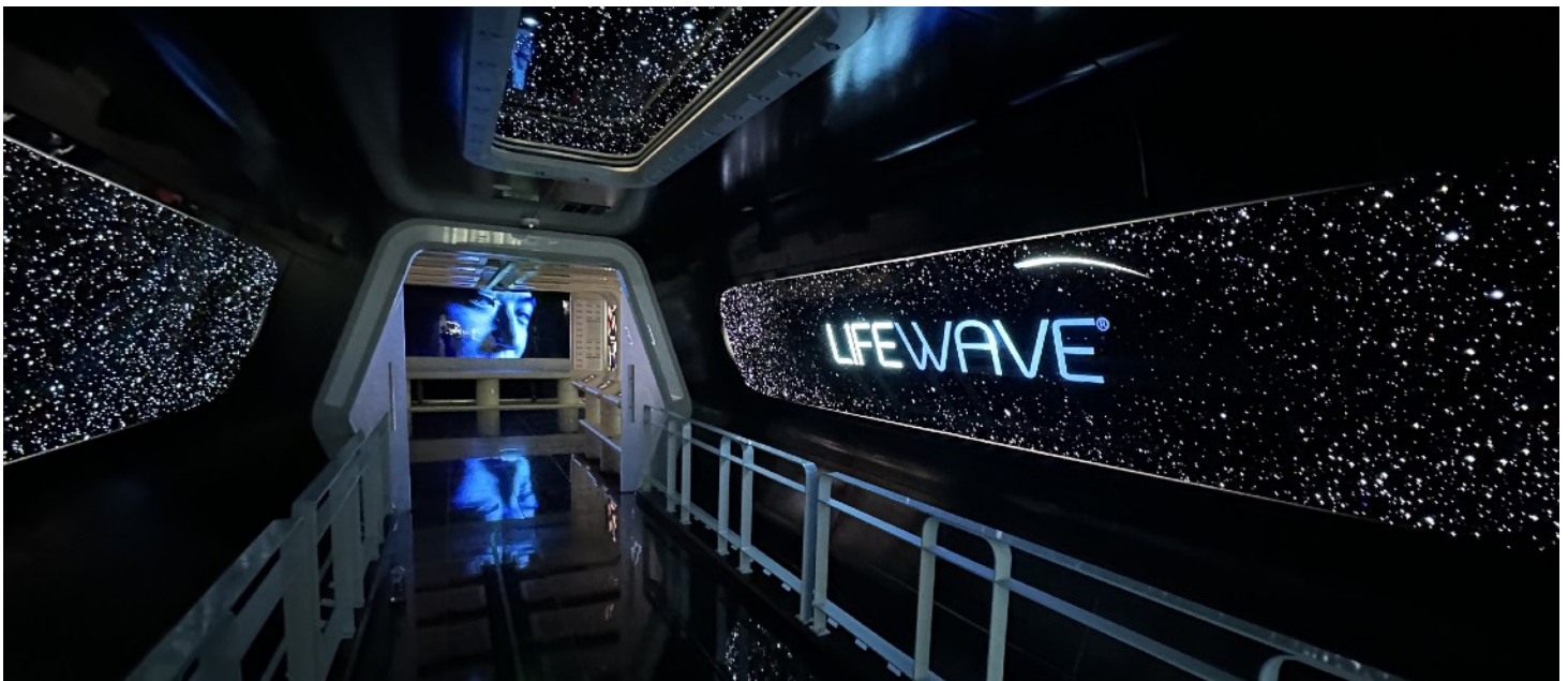
Tunnel Interior LifeWave