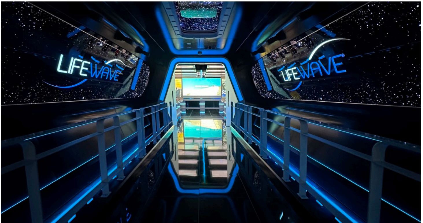
Welcome Center Tunnel LifeWave

The Welcome Center was developed with the system design and integration experts at Original Syndicate and features Megapixel's Ventana displays as the visual heartbeat of its most immersive zones. Leveraging Ventana's ultra-high resolution, modular design, and architectural versatility, the team created a space where experiential design meets futuristic innovation to deliver an unforgettable visitor experience.